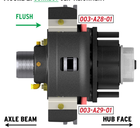
FIGURE 2: CORRECT CLIP ALIGNMENT