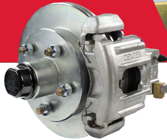
DEXTER | VORTEX. HIGH-PERFORMANCE LUBRICATION