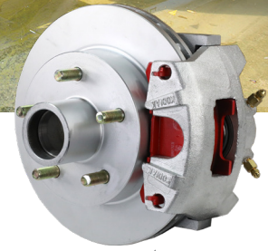
Kodiak BY DEXTER

Known for a wide selection of innovative and customizable marine products, Dexter has been the leading manufacturer of boat trailer axles, actuators, brakes and other marine components for over 65 years. Advanced coatings and corrosion-resistant materials deliver durability you can trust, season after season.