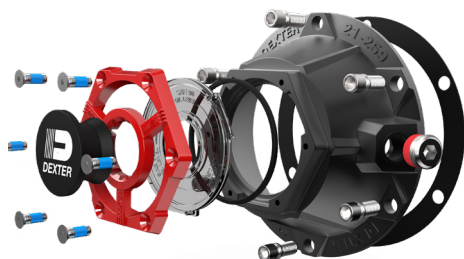
BOLT-ON CAP SERVICE KIT